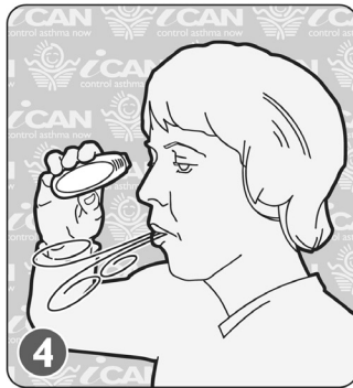
4 BREATHE OUT