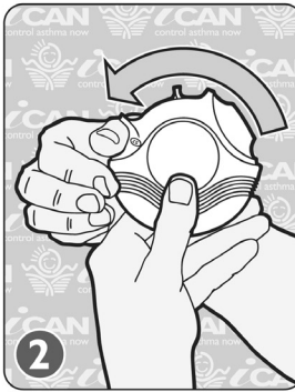
2 PUSH OPEN