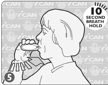
5 DEEP BREATH IN & HOLD