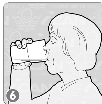
RINSE & SPIT