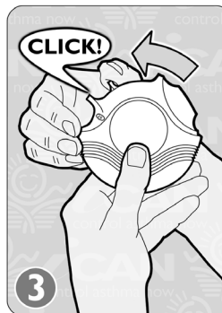
SLIDE & CLICK